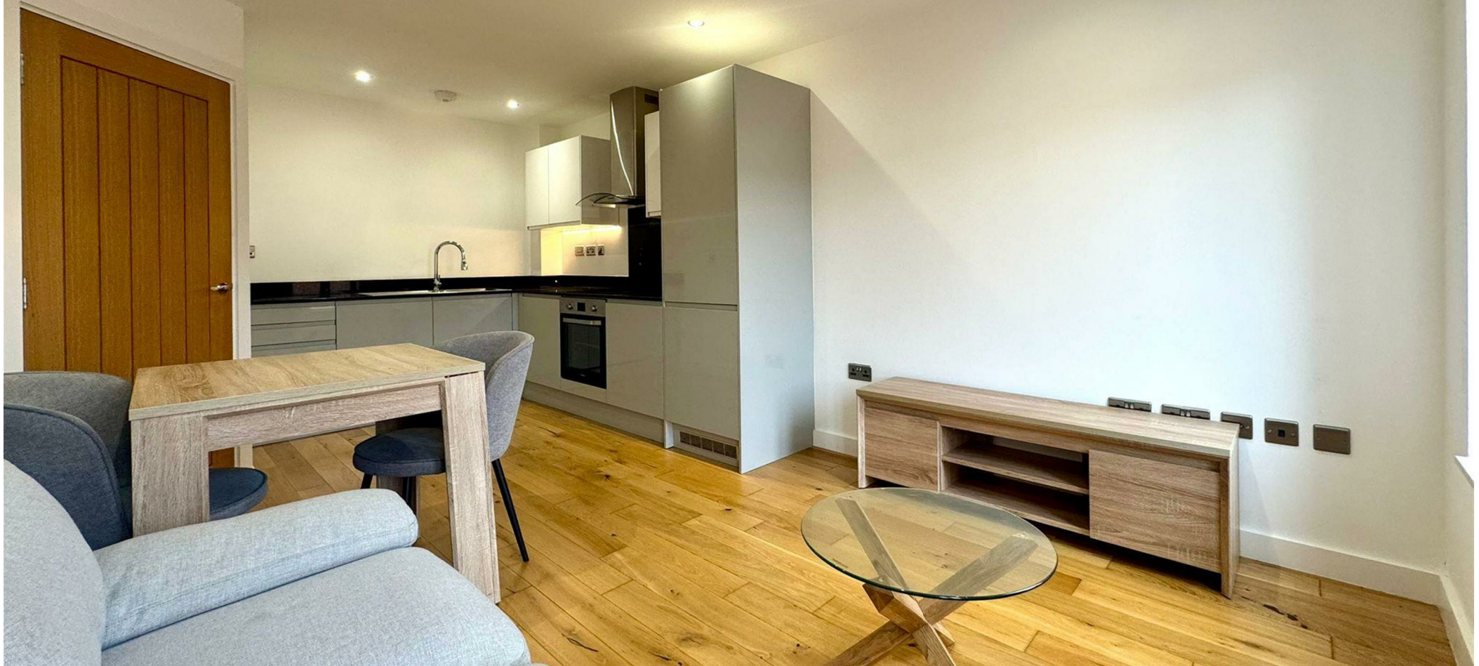
Apartment 25, 44 Camden Street, Birmingham, B1 3DP £1,095 Per month